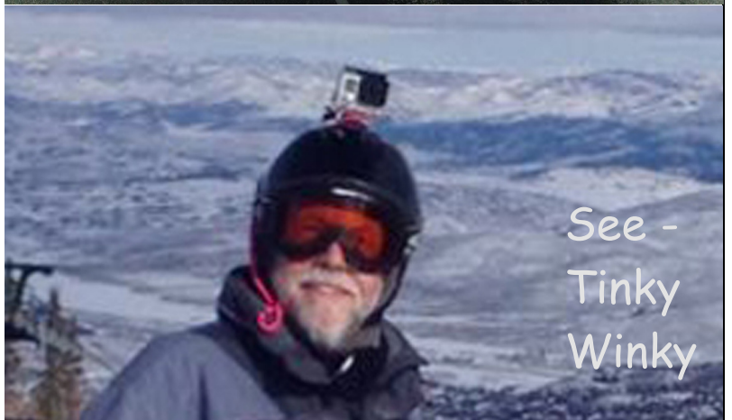
See - Tinky Winky