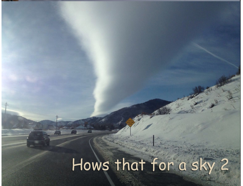
Hows that for a sky 2