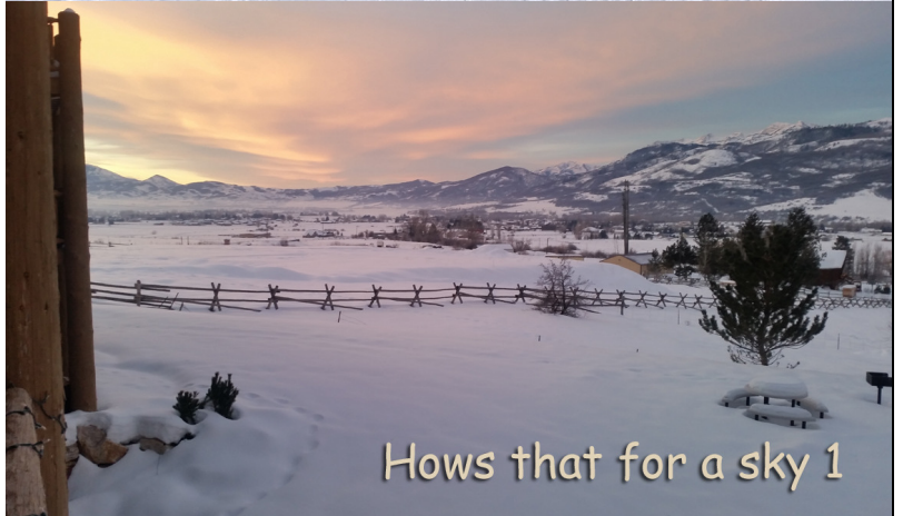
Hows that for a sky 1