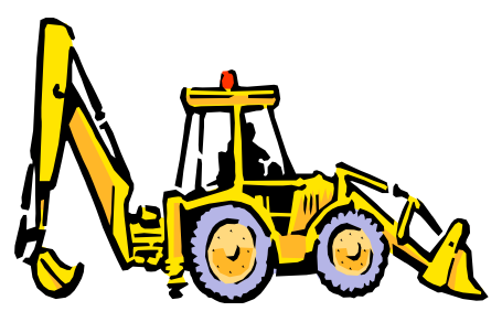
From our mucking out correspondent.